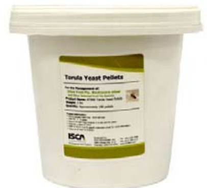
Torula Yeast Bait Pellets in a 2 lb. container.