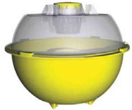
ISCA Ball Trap in yellow.