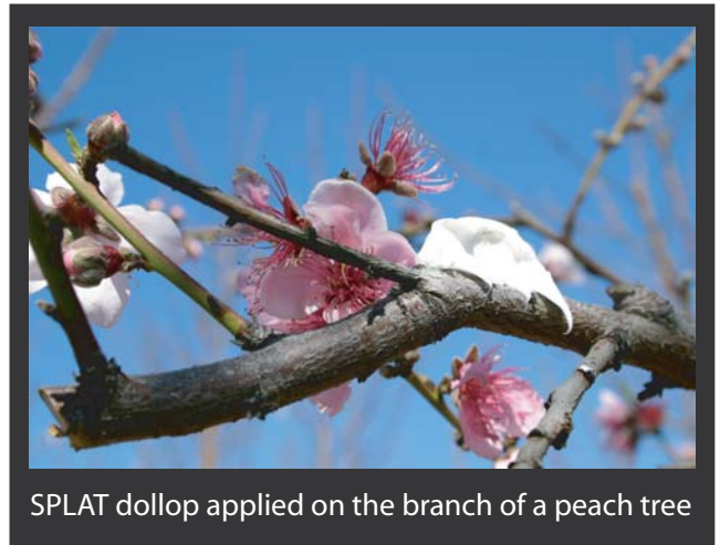
SPLAT dollop applied on the branch of a peach tree

ISCA Technologies is proud to introduce its Specialized Pheromone & Lure Application Technology (SPLAT) for the management of the light brown apple moth Epiphyas postvittana . SPLAT LBAM is an environmentally friendly mating disruption product that provides sustained and controlled release of the light brown apple moth pheromone. Independent field studies have shown SPLAT LBAM to be as or more effective than leading mating disruption products. For most orchards, one application of SPLAT LBAM has been demonstrated to provide mating disruption protection for the whole season. SPLAT LBAM is an outstanding alternative to standard pesticide treatments, where moths are found to develop resistance to insecticides. Additionally, SPLAT products are less expensive to apply than other conventional pheromone dispensers since application is less labor intensive; mechanical applications include the use of: tractors, metered backpack sprayers, caulking guns, metered dosing guns, paintball guns, aircrafts, etc. (see photos).