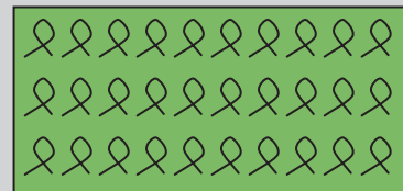
Figure 1a: For traditional dispensers, changes in the number of dispensers, changes amount of AI per acre.