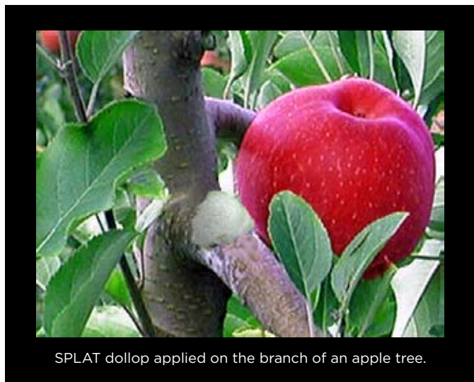
SPLAT dollop applied on the branch of an apple tree.

ISCA Technologies is proud to introduce its Specialized Pheromone & Lure Application Technology (SPLAT) for the management of the codling moth Cydia pomonella and other Cydia species. SPLAT Cydia is an environmentally friendly mating disruption product that provides sustained and controlled release of the codling moth pheromone. Independent field studies have shown SPLAT Cydia to be as or more effective than leading mating disruption products. For most orchards, one application of SPLAT Cydia has been demonstrated to provide mating disruption protection for the whole season. SPLAT Cydia is an outstanding alternative to standard pesticide treatments, where moths are found to develop resistance to insecticides. Additionally, SPLAT products are less expensive to apply than other conventional pheromone dispensers since application is less labor intensive; mechanical applications include the use of: tractors, metered backpack sprayers, caulking guns, metered dosing guns, paintball guns, aircrafts, etc. (see photos).