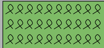
Figure 1a: For traditional dispensers, changes in the number of dispensers, changes amount of AI per acre.